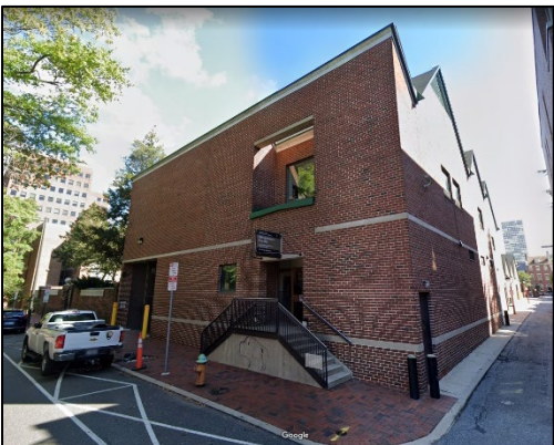
Independence National Historic Park Maintenance Facility