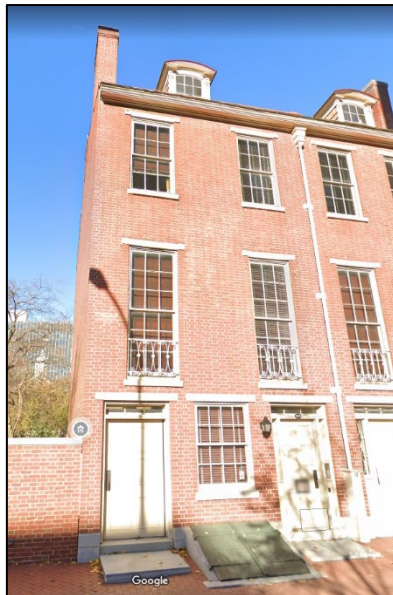
325 Walnut Street Offices