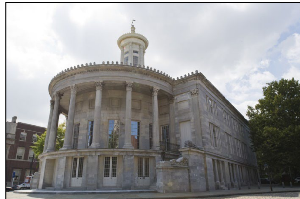
Merchants' Exchange Building