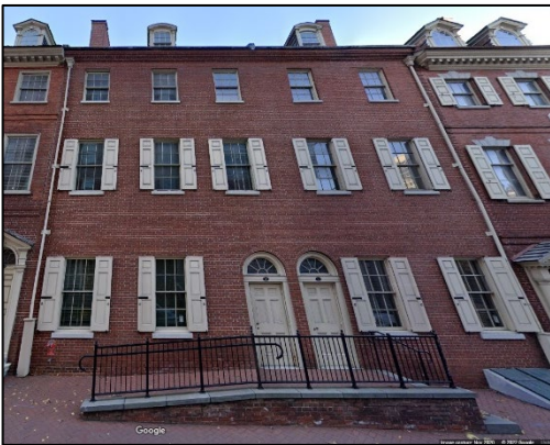
313 Walnut Street Offices

Taggart Brown & Associates was awarded extensive repairs and maintenance to several elevators across six (6) facilities at Independence National Historic Park in Philadelphia. In addition to A-E services, we are removing and installing new main controllers, door controllers, pump units, disconnect switches, starter panels, conduit & wiring, in-ground cylinders, lighting fixtures, and life safety fixtures such as pit ladders and fire suppression. In addition, one elevator is being removed in its entirety and a new enlarged one installed to meet ADA compliance regulations. Minor interior wall and ceiling repairs are also included in this project. Below are photographs of the facilities in which the elevators are located.